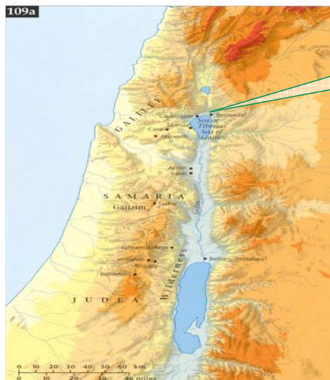
The area of Capernaum and Bethsaida.

. . . and entered Simon's home (Peter's house in Bethsaida).